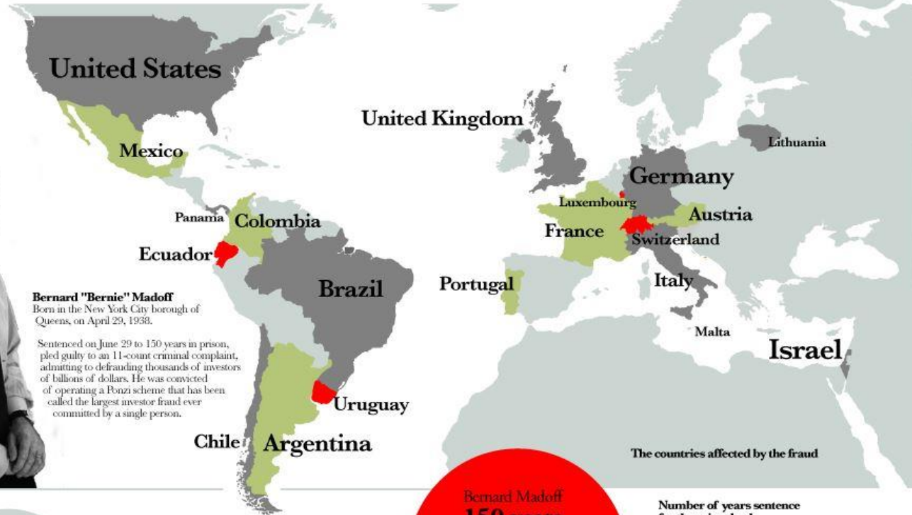
The countries affected by the fraud

Sentenced on June 29 to 150 years in prison, pled guilty to an 11-count criminal complaint, admitting to defrauding thousands of investors of billions of dollars. He was convicted of operating a Ponzi scheme that has been called the largest investor fraud ever committed by a single person.